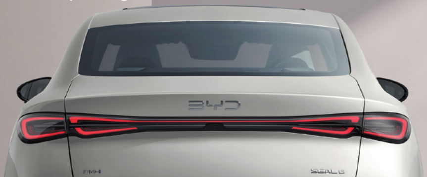
Dual C-shaped taillight